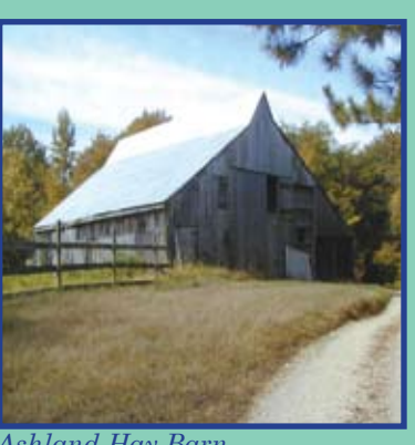
Ashland Hay Bar. Upper Marlboro

Historic site and historic district designation recognizes and protects the character of the designated property or area. Historic site owners are eligible to receive bronze plaques awarded by the HPC to place on their properties. In addition, owners may be eligible for a Prince George's County Preservation Tax Credit on county property taxes of ten percent of the cost of approved restoration work, or five percent of the cost of compatible new construction within a historic district. Owners may also qualify for preservation loan programs when such funds are available. Property owners are encouraged to contact staff and submit an application for tax credits prior to the commencement of work.